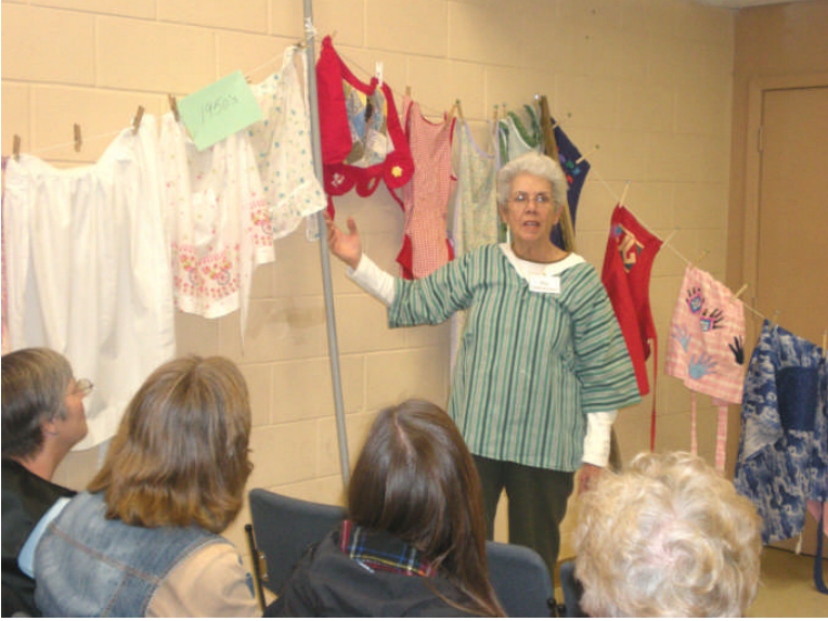
Aprons EVERYWHERE !