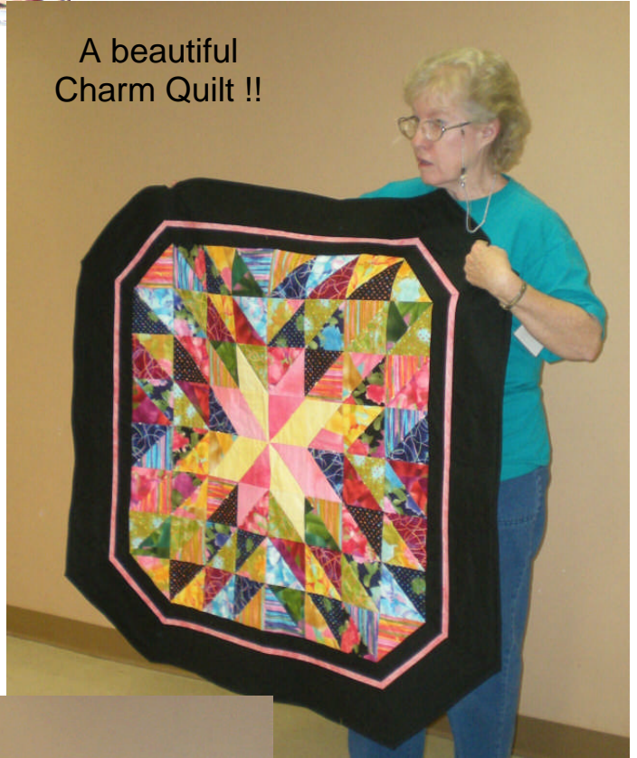
A beautiful Charm Quilt !!