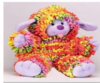
A new meeting room