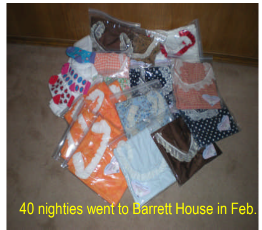
40 nighties went to Barrett House in Feb.

May 2 is the annual FREE Nancy Floyd Haworth Foundation Cancer event at the Embassy Suites Hotel, 1000 Woodward NE, from 9 to noon. Three very good seminars are presented about reducing and surviving cancer. Call 265-6343 for info or to attend. Check the website at NFHFoundation.org .